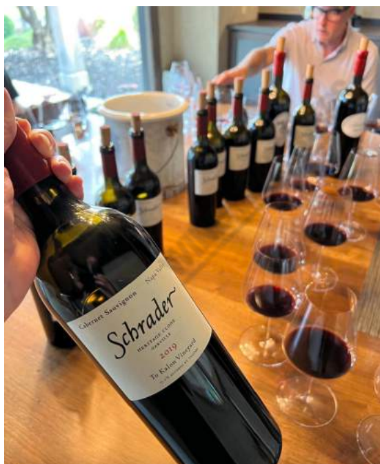
The Schrader California Heritage Clone 2019 shows incredible depth and seamless tannins.

His first release of his perfect red, the To Kalon Vineyard Co. Cabernet Sauvignon Napa Valley Oakville H.W.C. To Kalon Vineyard 2019, is a small-production bottling of a selected parcel of To Kalon and it really is unique. It is the essence of Napa cabernet and has a balance and purity with an endless finish.