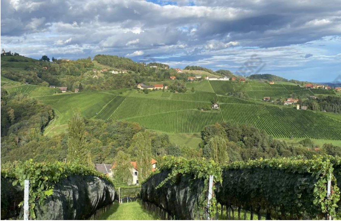
The vineyards of Wohlmuth in the Kitzeck sub-area of the Styria, where riesling and sauvignon blanc flourish side by side.