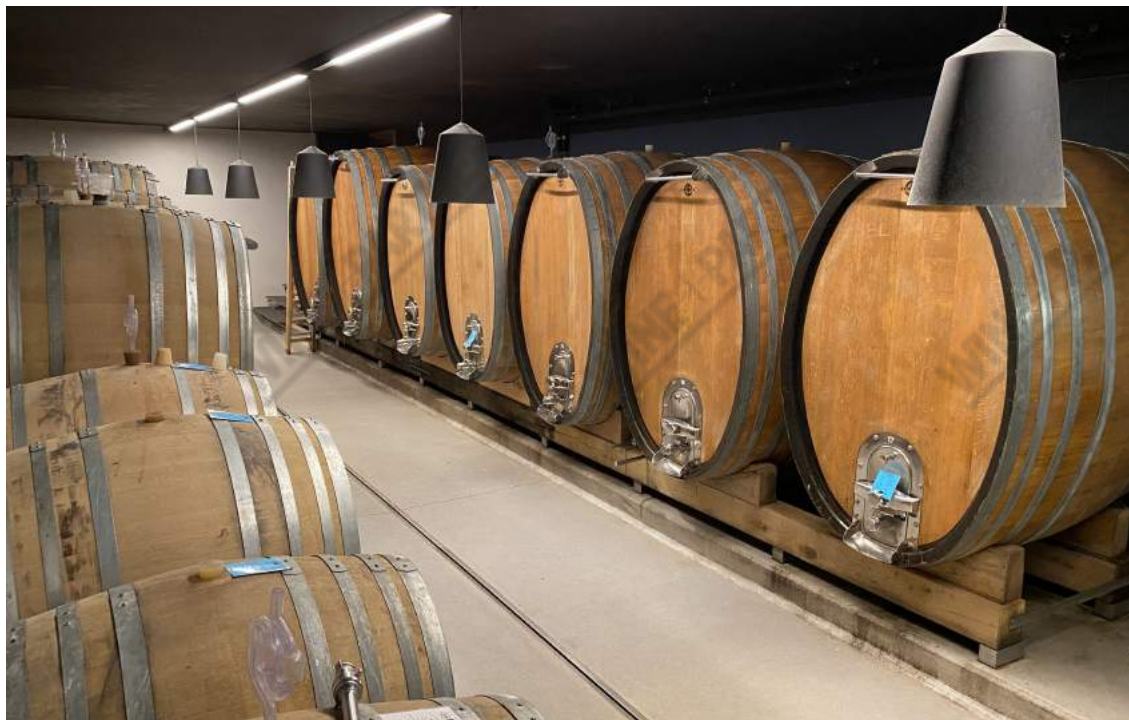
The barrel cellar at the Lackner-Tinnacher winery in Styria.

The best of the Eisenberg wines were those of Wachter-Wiesler and the star among them is the spectacularly fresh and mineral Wachter-Wiesler Blaufränkisch Eisenberg Ried Weinberg Reserve 2019.”