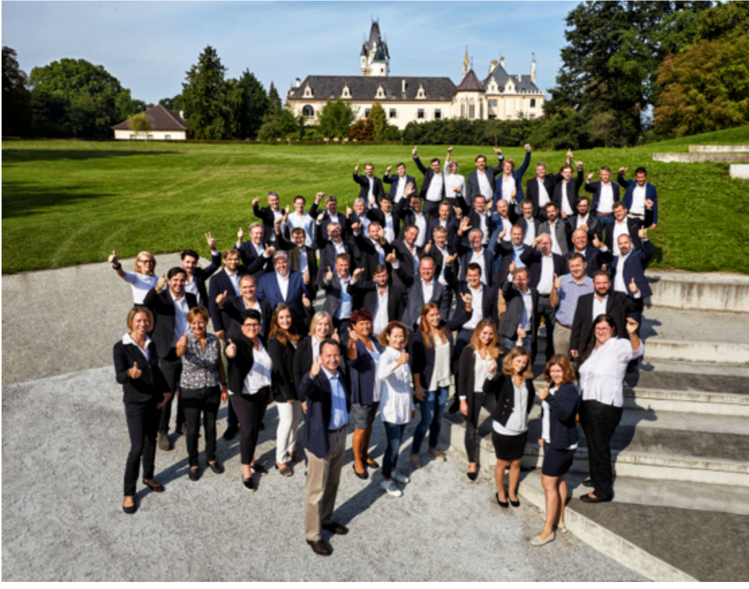
ÖTW

For five days, winemakers will personally serve around 500 site-specific wines. ÖTW wines can be tasted from Monday to Thursday, with Styria's STK wineries joining on the first two days. Burgenland's Eisenberg and Leithaberg are guests on Thursday, while on Friday the event moves to Wachau to Dürnstein castle.