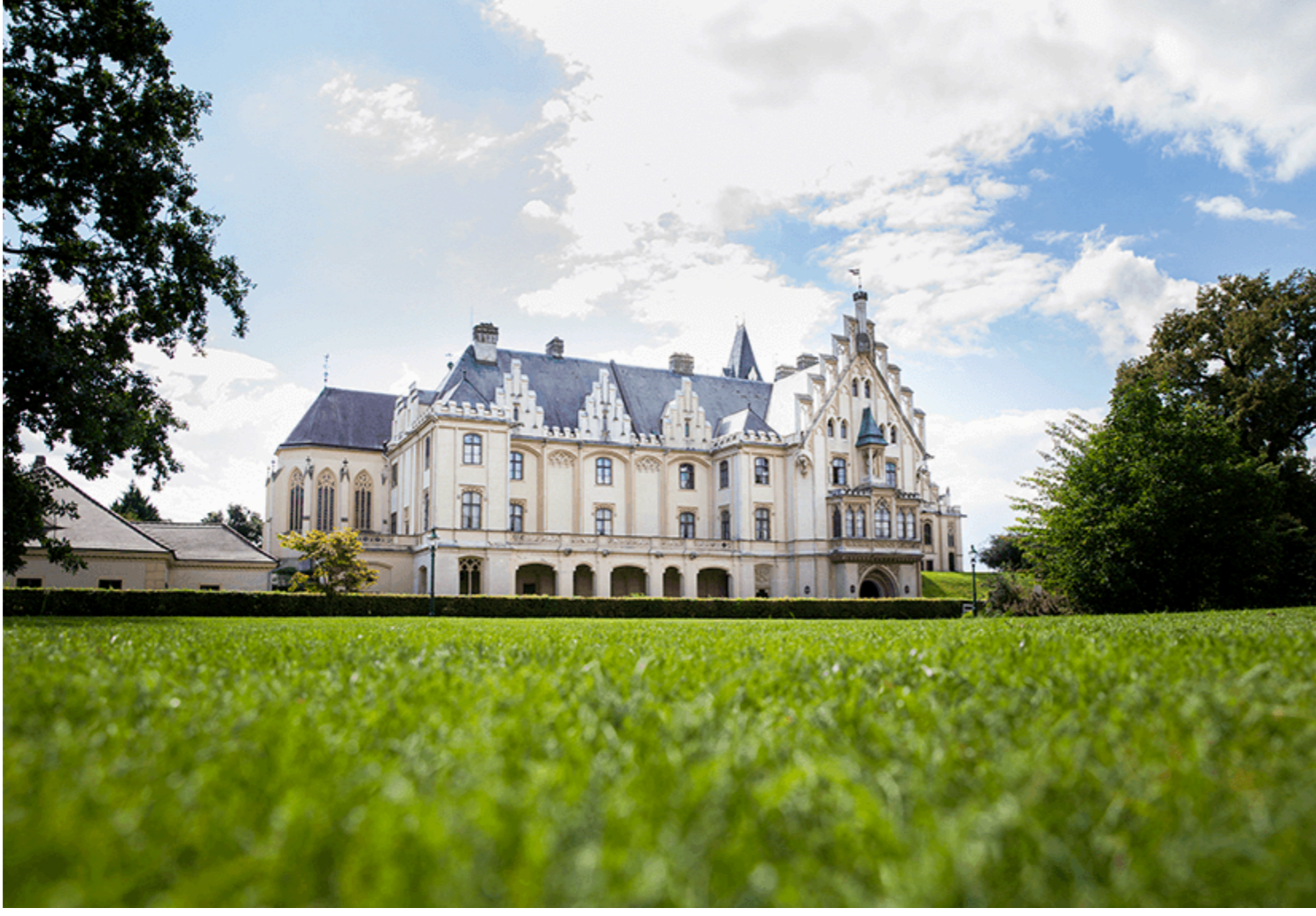
Grafenegg castle provides a fairytale setting for the best Austrian wines at the ÖTW Single Vineyard Summit.

Austria's most exciting and demanding tasting returns in 2023 with an unprecedented selection of single vineyard wines, spanning more appellations than ever before. From 4 - 8 September, around 500 wines will be presented to international trade media, importers, sommeliers and specialist retailers at Grafenegg castle.